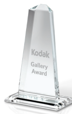
KODAK Gallery Award

It is the responsibility of the photographer whose entry is submitted to own copyright to each entry and to have in his/her possession signed and dated releases for each subject, model and location. By entering the competition, the photographer acknowledges and accepts this complete responsibility and grants Kodak Alaris use of the entry.